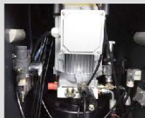
High Quality Ball Valve