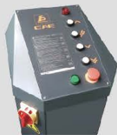
24v Safe Control System