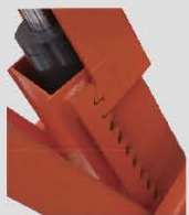
Pneumatic Release Mechanical Lock